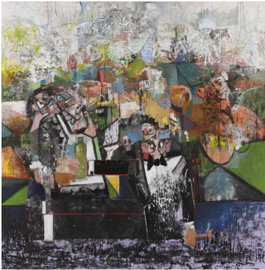
George Condo, The Fallen Butler , 2009, The Museum of Modern Art, New York

Works by George Condo can be found in museum collections around the world, including Rush Hour , 2010 at the Metropolitan Museum of Art and The Fallen Butler , 2009 at the Museum of Modern Art.