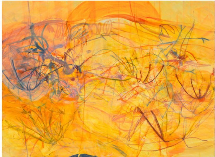
When Will the Sun Rise? 2021, Los Angeles County Museum of Art