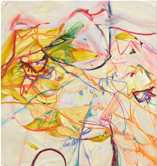
Our Unpleasant Bliss , 2020, Musee d'Arte Moderne de Paris

Similar Jadé Fadojutimi works can be found in major collections around the world including Our Unpleasant Bliss , 2020, at the Musee d'Arte Moderne de Paris, and When Will the Sun Rise? 2021, at the Los Angeles County Museum of Art.