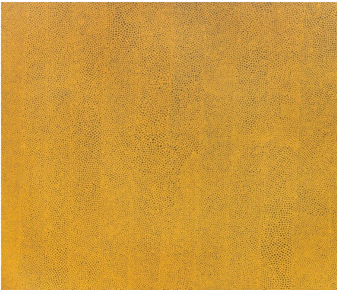
Yayoi Kusama, Infinity Nets Yellow , 1960, The National Gallery of Art, Washington, DC

Similar works can be found in major museums across the globe, including Infinity Nets Yellow , 1960, at the National Gallery of Art, Washington D.C., and Infinity Nets (QZOWA) , 2007, at the Mori Art Museum, Tokyo.