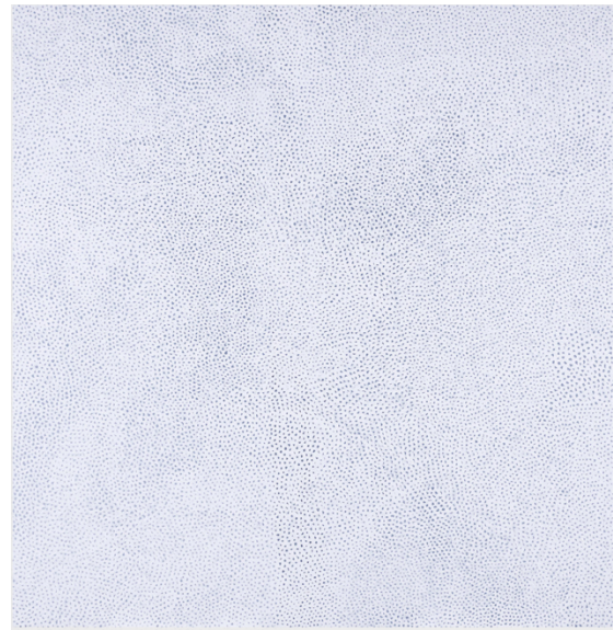
Yayoi Kusama, Infinity Nets (QZOWA) , 2007, Mori Art Museum, Tokyo