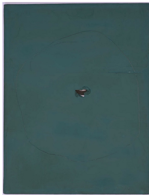
Lucio Fontana, Concetto Spaziale , 1960-62, The Menil Collection, Houston